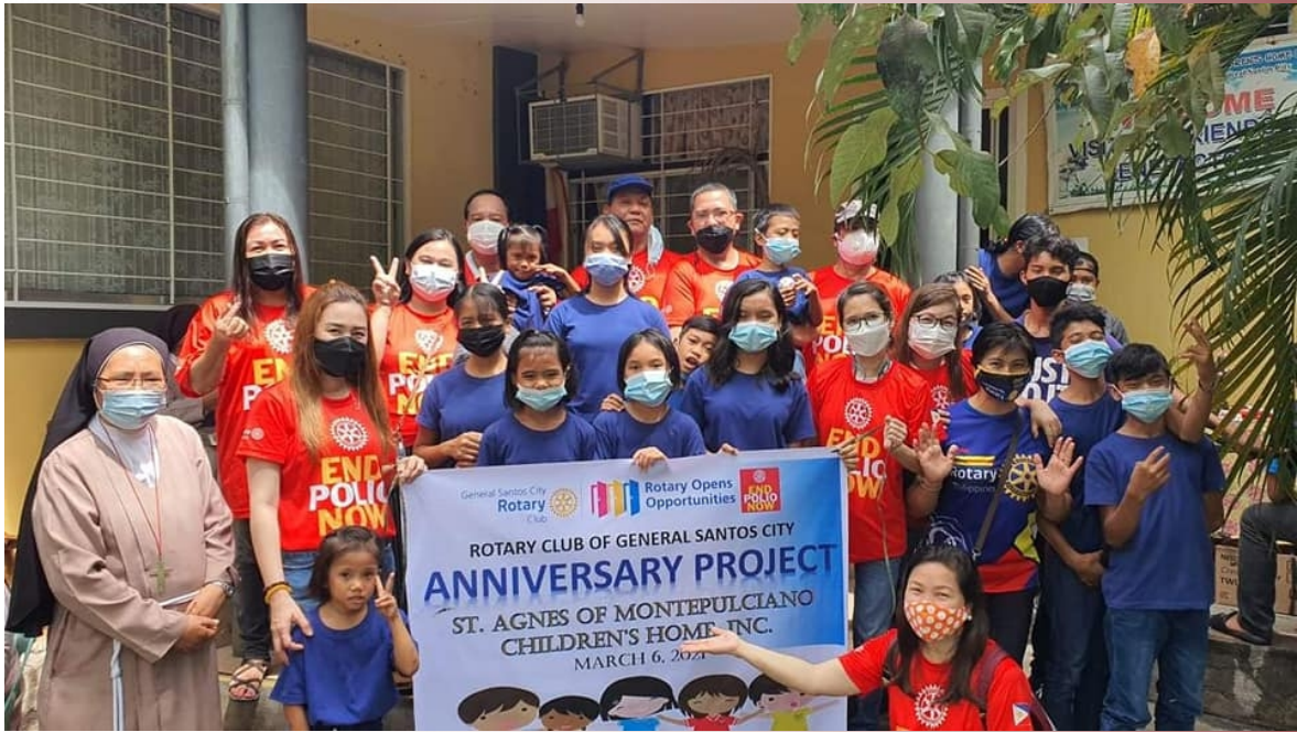
RC GENERAL SANTOS ANNIVERSARY PROJECT AT ST. AGNES OF MONTEPULCIANO CHILDREN'S HOME INC LAST MARCH 6, 2020